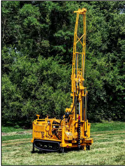
CME-55 on CME-300 Carrier

The CME-45C, CME-55 and low clearance CME-55LC and CME-55LCX are available mounted on the remote controlled CME-300 tracked carrier. This machine can climb hills, traverse mud, sand, rocks and snow...all while your operator's feet are planted firmly on the ground.