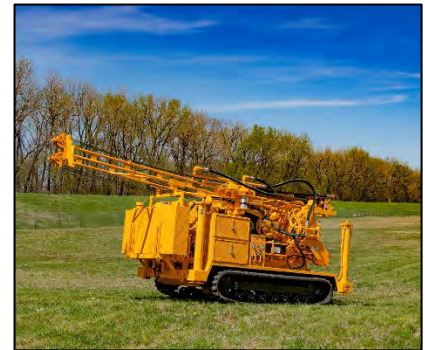
CME-45C on CME-300 Carrier