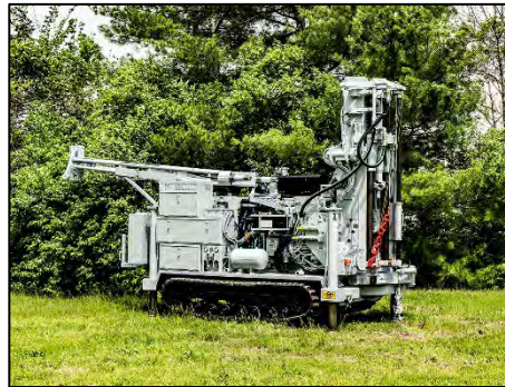
Low Clearance CME-55LCX on CME-300 Carrier

Drills mounted on the CME-300 carrier are available with all the features you need to get the job done as efficiently as possible. You can equip them with in/out and sideways slide bases, angle drilling, automatic SPT hammer, auger racks, tool boxes and more.