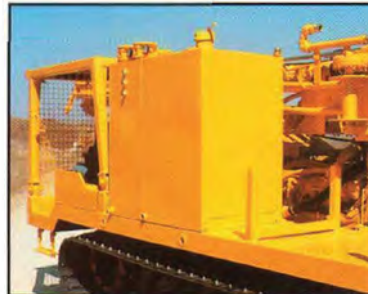
140 gallon water tank