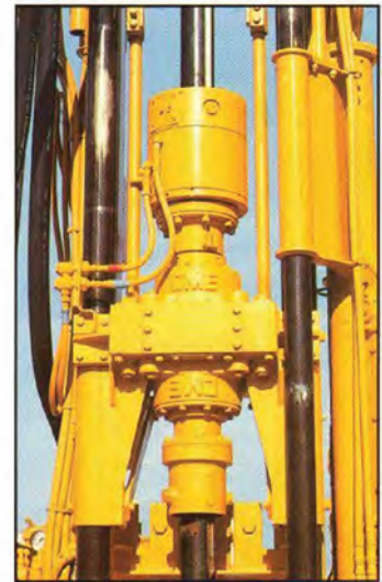
Fluted kelly and chuck assembly