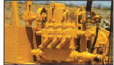
FMC Triplex 40 gpm/800 psi water pump